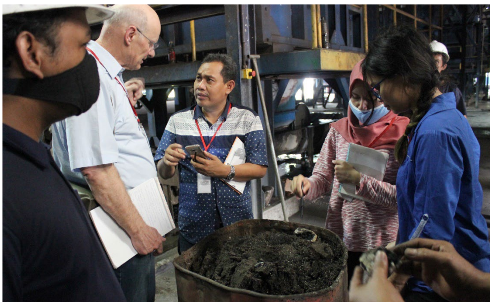
Resource Efficient and Cleaner Production (RECP) assessment in a textile factory in Indonesia

For each specific recipient country with substantial activities during GEIPP period a country specific committee will be established, to provide guidance for the implementation of single country-specific interventions. The Country Steering Committee consists of representatives of SECO-office in the respective country, designated country programme manager for the country activities, and key country beneficiaries (Ministries and leading private sector agencies) and meets at least one month ahead of the scheduled GEIPP-SC to prepare an update of the progress of country performance.