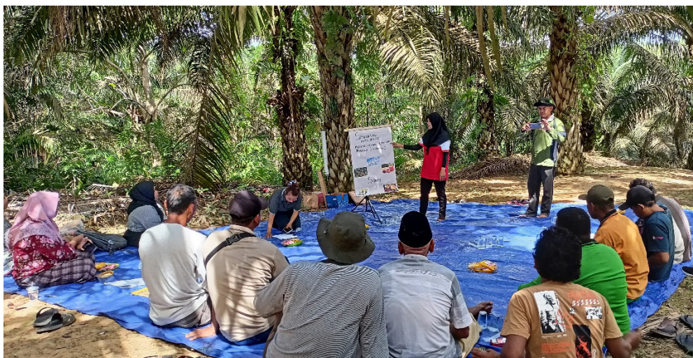
Farmer field school in Bengalon sub-District, East Kutai

Component 2 : Establishes a Program Support System to foster a community of practice and facilitate knowledge sharing and learning exchanges across landscapes and intergovernmental agencies at both national and subnational levels.