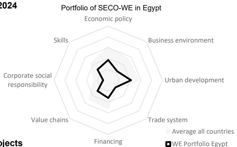
The relative importance of the eight business lines in SECO-WE's part of the cooperation programme in Egypt.

As of August 2022, around 43 projects financed by SECO are active in Egypt.