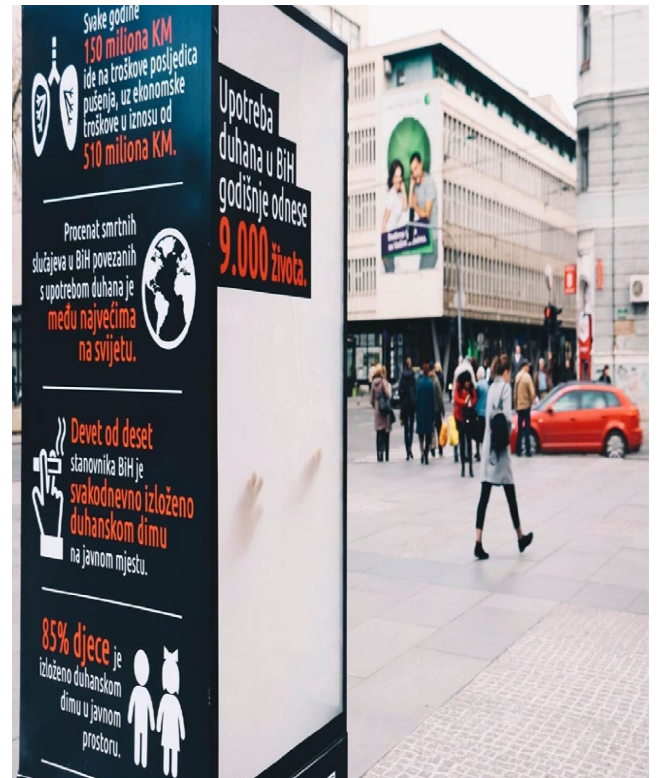
Raising public awareness on the importance of a smoke free environment aims to improve public health. "Klima bez dima" campaign, Reducing Health Risk Factors Project.

A mid-term review of the Swiss Cooperation Programme will assess the relevance of the Programme, report the most important results with regard to the Programme's strategic objectives, identify any necessary adaptations and feed into the new Swiss Cooperation Programme.