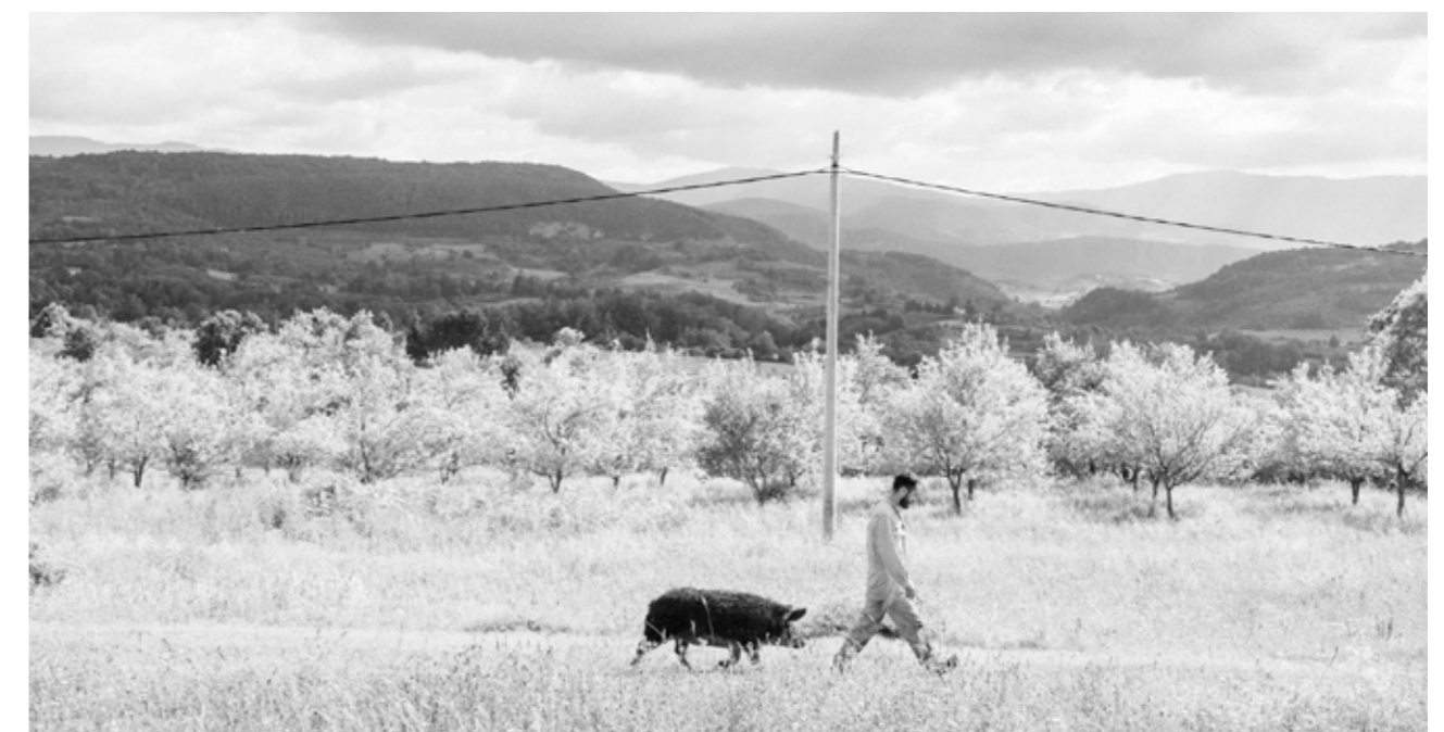
Better service for patients in the community mental health centers significantly reduce the need for patients to be hospitalized. Exhibition “Čovjek je čovjek”, Mental Health Project.