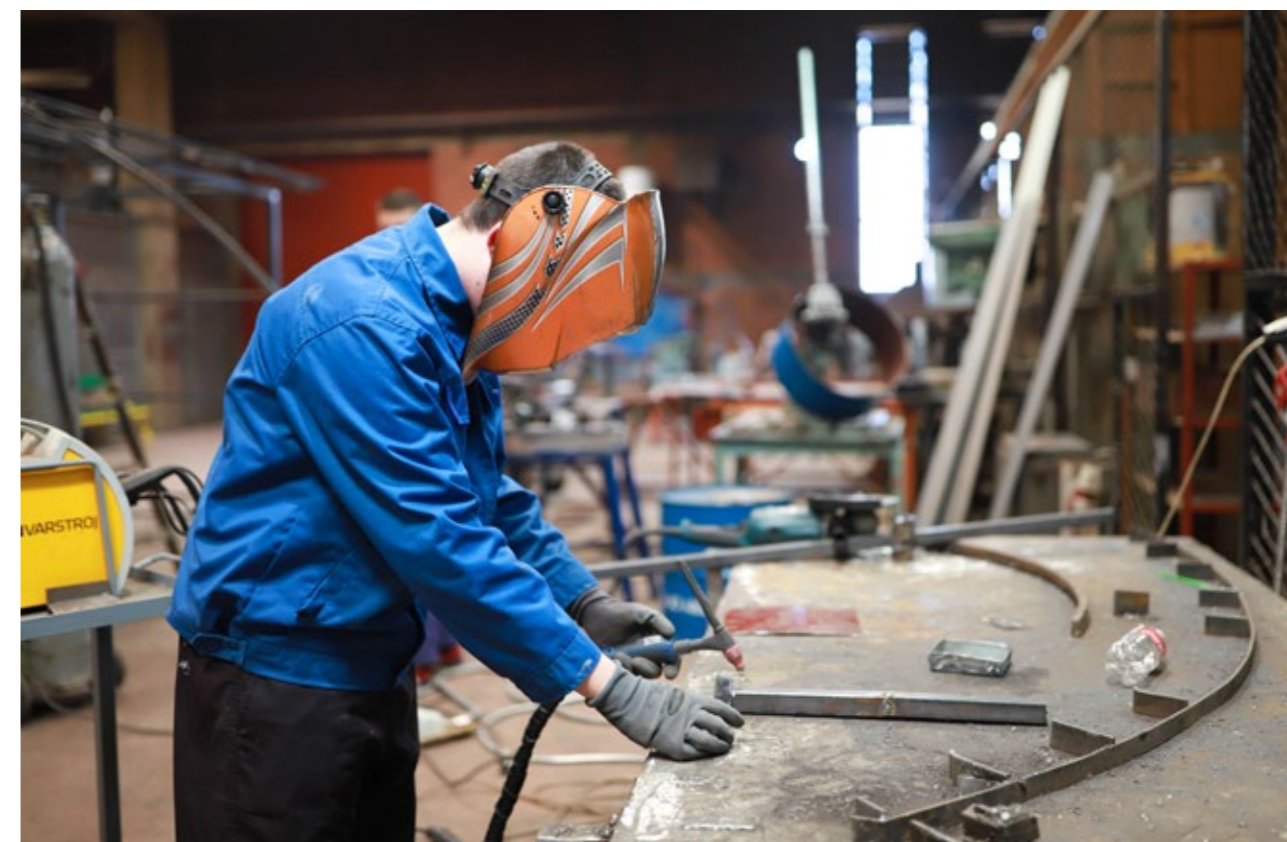
Strengthening vocational educational and training contributes to lower youth unemployment. Strengthening Technical Vocational Education and Training Project, JU Tehnička škola Gradiška.

Outcome statement 2: Local governments (LGs) improve their performance, are more accountable, and provide high-quality and equitable services, in particular in the wa-