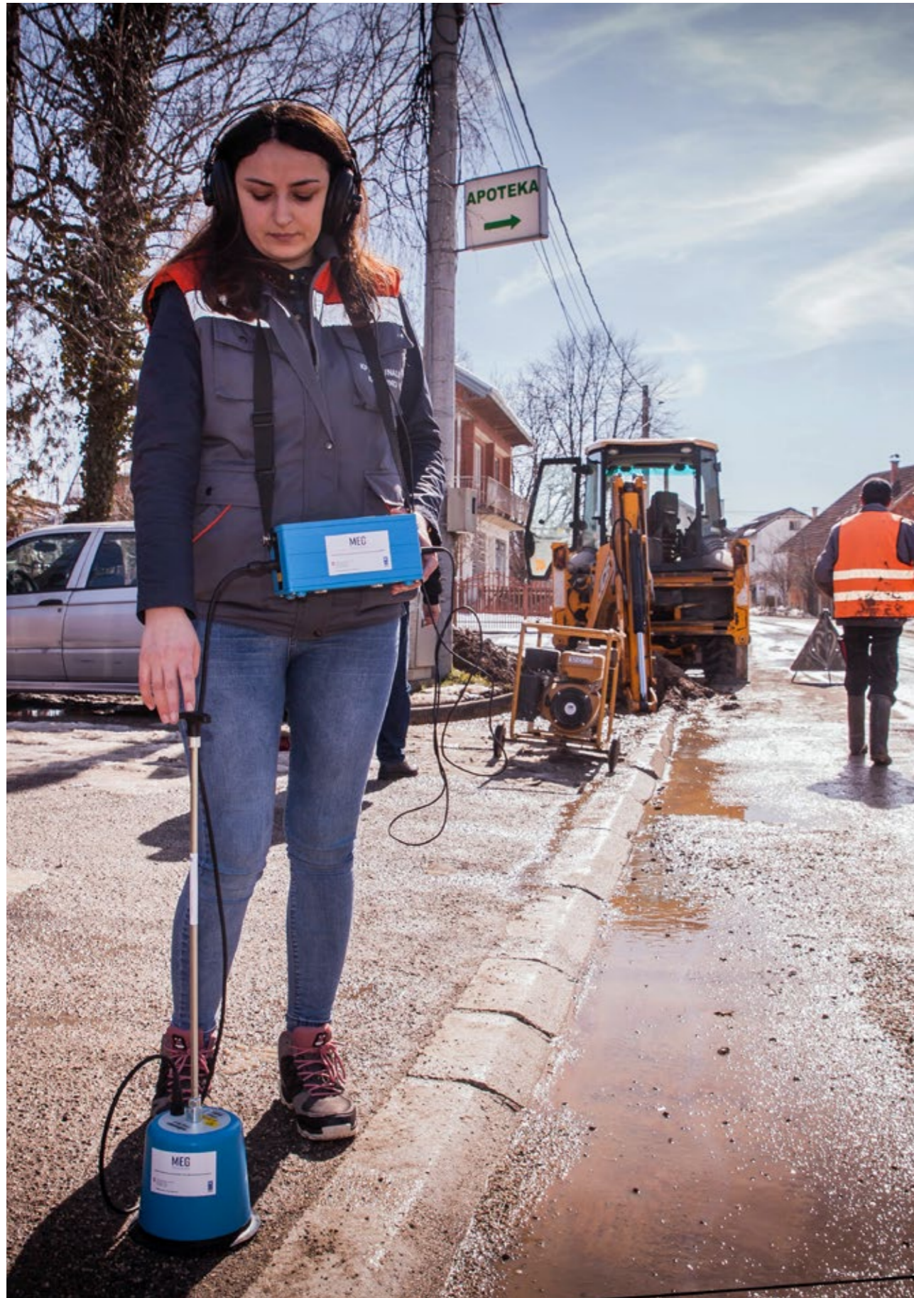
Repairing water pipes: Authorities are supported to provide better access to drinking water and ensure waste water treatment. Municipal Governance and Environment Project, Kostajnica.