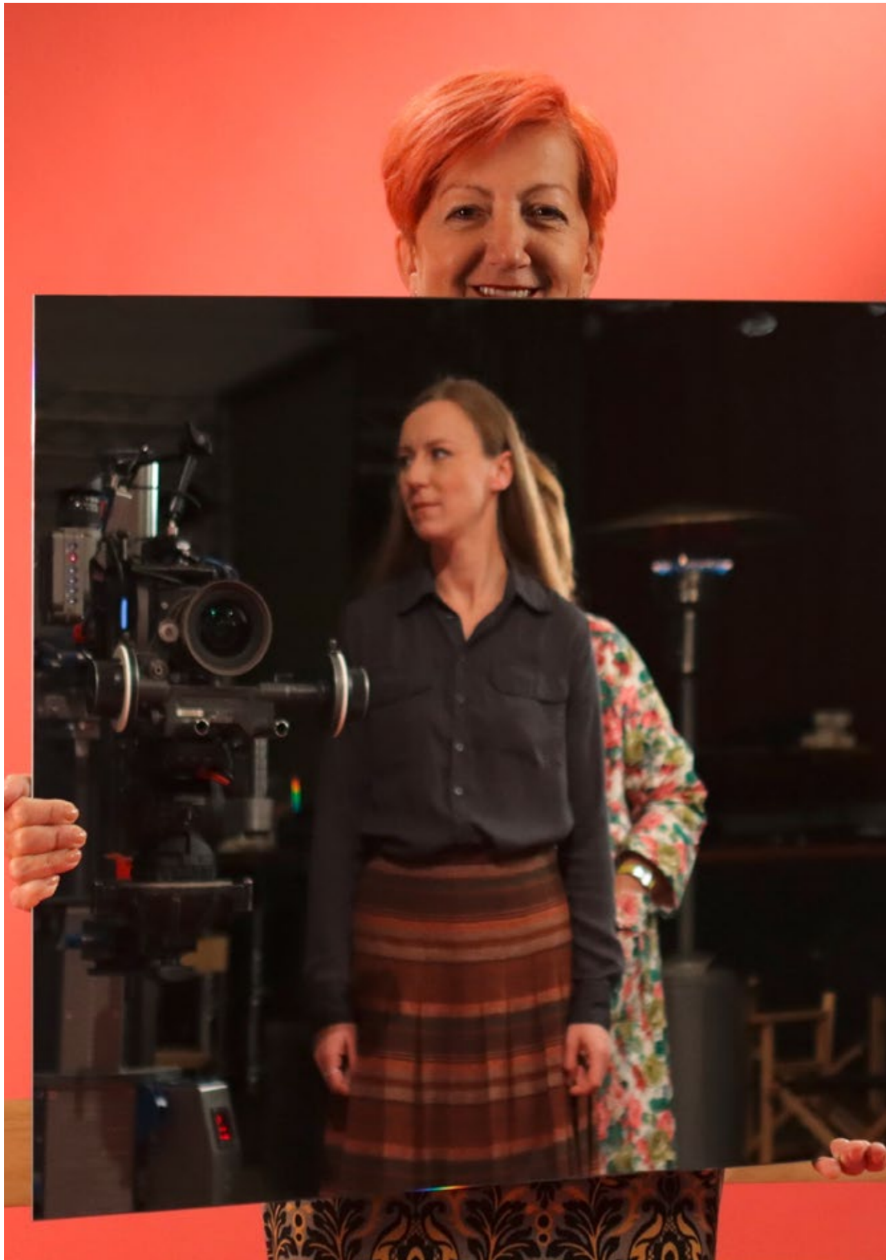
By asking people to vote for female candidates in local elections. The “Ja glasam za ženu” campaign promotes women’s visibility and participation in politics.