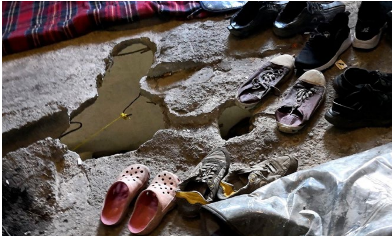
Switzerland supports the provision of health care services to migrants both in official reception centers as well as to people sleeping in spontaneous settlements. Bira Center, near Bihać.