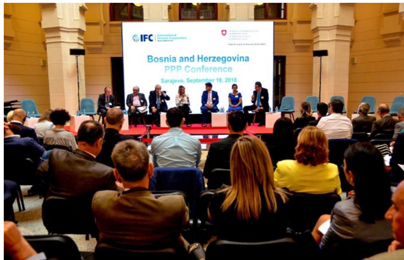
Public-Private Partnerships are essential for achieving progress. PPP conference Public-Private Partnership Project.

The challenge of obtaining results in a country with a complex political system and a limited readiness for consensus will remain. Thus an adaptive management approach will be applied to respond to emerging opportunities and unexpected developments. The reorganisation of the cooperation team will be completed by mid-2021. The reallocation of portfolios will not only allow programme officers to have a fresh look at each project and project partner, but will also allow team members to acquire new skills for the successful implementation of the Cooperation Programme. In addition, Switzerland's increased engagement in policy influencing will require skills development beyond project management.