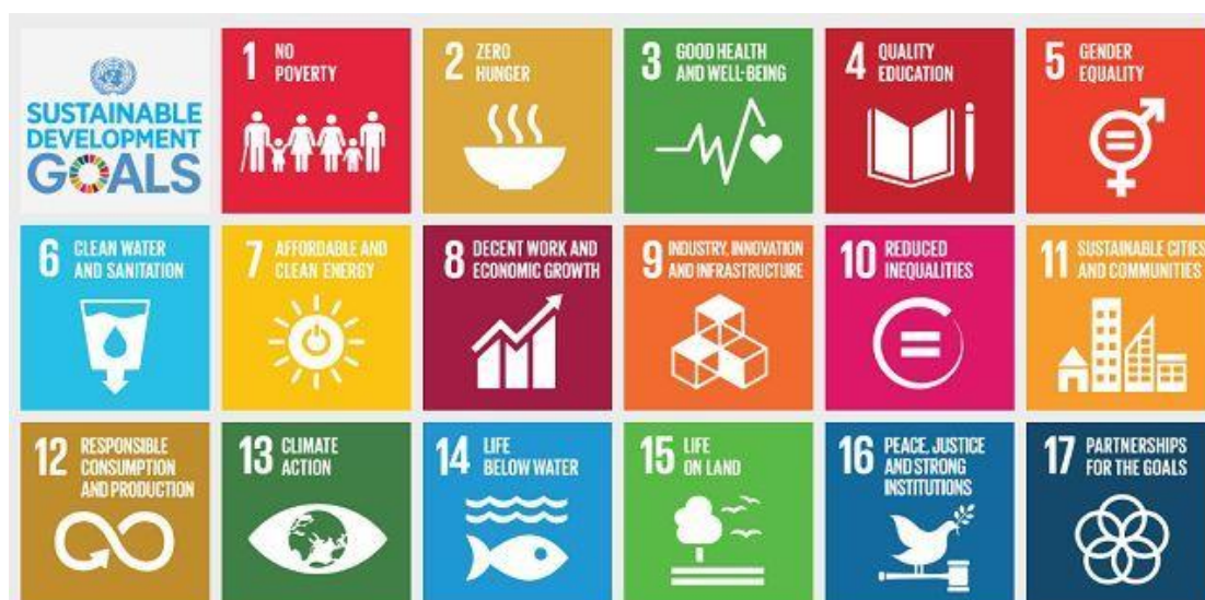
Figure 1: 17 SDGs

The Swiss Dispatch 2017-2020 mentions that the Swiss Development Policy has a new frame of reference including the 2030 Agenda and the 17 SDGs, but there is no information as to how the SDGs are related to the Dispatch's five credit frameworks, common or strategic objectives etc.